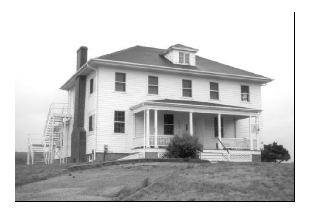
Figure 186. Pamet River Lifeboat Station Adaptively Reused as a Youth Hostel, 1997.

provided to the second floor, as access is not possible without destruction of historic fabric. As a compromise, interpretive information will be provided on the first floor and outside the building to educate the public about the history of the station. When physical constraints and character-defining features are in jeopardy, the federal government allows education and interpretation as alternatives to direct access.