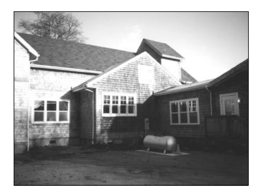
Figure 192. Keeper's Dwelling (1915) Enveloped, Coos Bay Lifeboat Station, 1999.