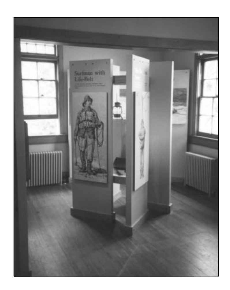
Figure 195. Keeper's Office Interpretation, Sleeping Bear Point Life-Saving Station, 1997.