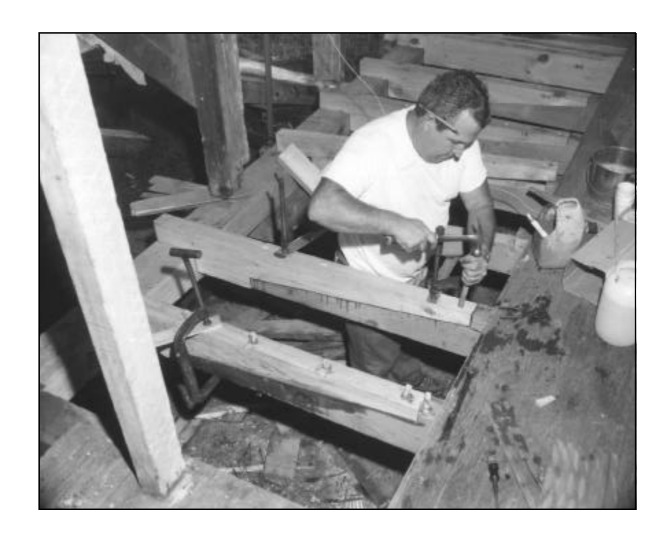
Figure 184. Splicing Floor Joists at Block Island Life-Saving Station, Rhode Island, 1970.

The most important part of a restoration is not to remove more original material than is absolutely necessary. If a floor joist is rotten only at the sill, do not replace the entire floor joist. Instead, splice on a new end with an in-kind material and save as much of the original fabric as possible (Figure 184).