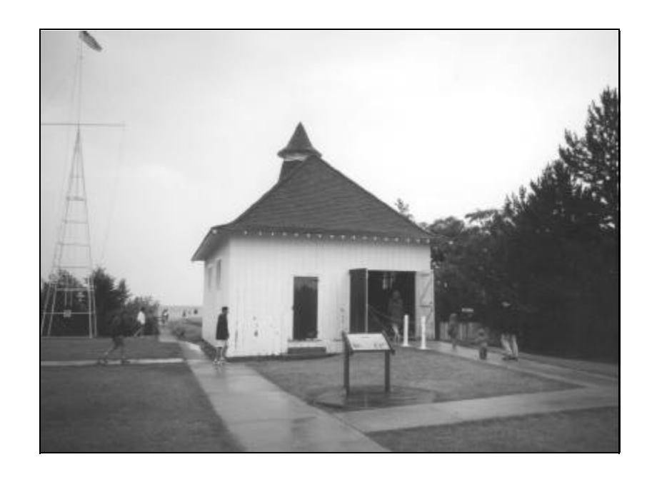
Figure 198. Boathouse (1901), Sleeping Bear Point Life-Saving Station, 1997.

With time, hopefully, the Port Orford Lifeboat Station will evolve into a museum on par with Sleeping Bear Point.