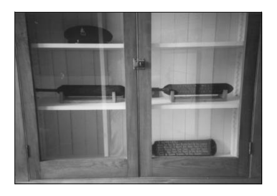
Figure 196. Kitchen Cabinet Interpretation, Sleeping Bear Point Life-Saving Station, 1997.