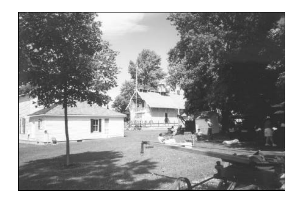
Figure 189. Pointe Aux Barques Life-Saving Station (1875-76) in New Context at Huron City Museum, Huron City, Michigan, 1997.