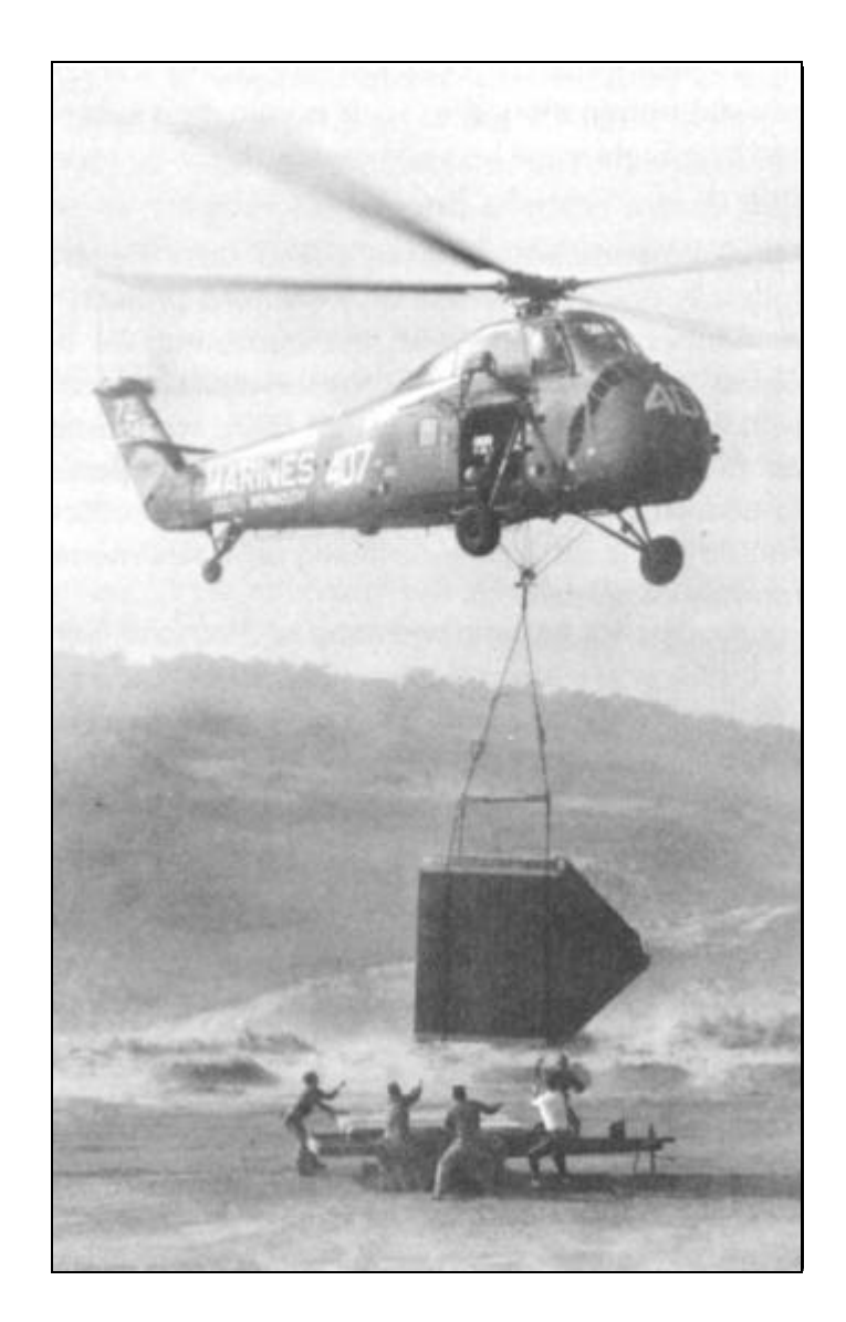
Figure 188. Marine Helicopter Moving Halfway House at Mystic Seaport in 1968.