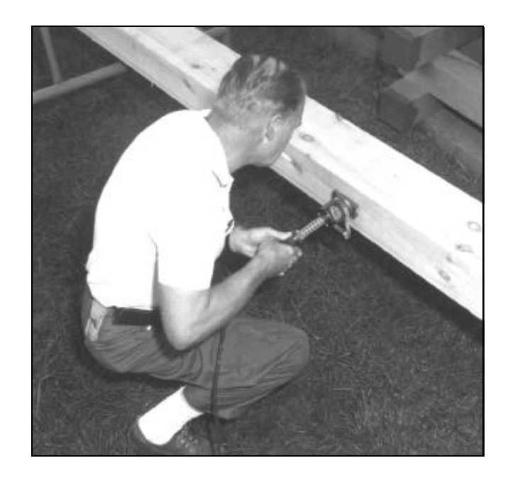
Figure 185. Marking New Material, Block Island Life-Saving Station, Rhode Island, 1970. Source: Mystic Seaport (#70-9-213).

and should be well-documented. The mind-set should be that whatever is removed will be lost forever and that there is no time like the present to record what is being done. Newly installed material should also be recorded with equal care so that later researchers can understand what was done. Any new construction material should be date stamped (Figure 185), and a written and visual record made.