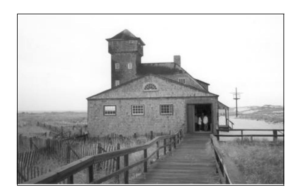
Figure 190. Old Harbor Life-Saving Station (1898) in New Context at Race Point, Massachusetts, 1997.