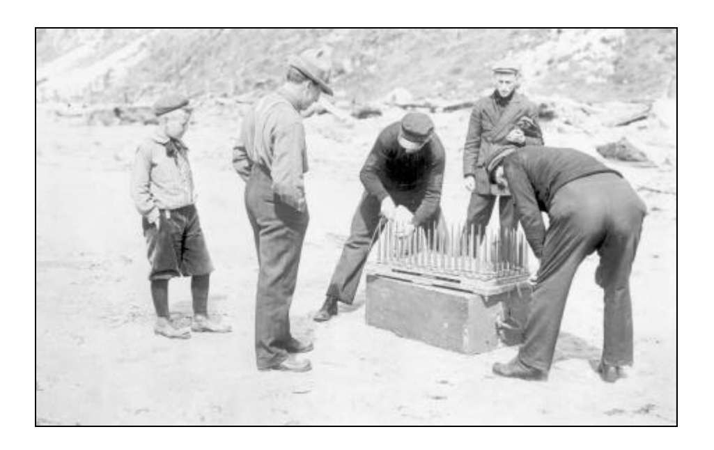
Figure 193. Faking Shot Line at Yaquina Bay, Circa 1910. Source: Lincoln County Historical Society (LCHS #2265).

Considered one of the best examples of interpretation of the Life-Saving Service is the Sleeping Bear Point Life-Saving Station (1901) at Sleeping Bear Dunes National Lakeshore near Empire, Michigan. The former station has been restored by the National Park Service. It is a model for the proper restoration and interpretation of a life-saving station or lifeboat station. The station is a Marquette-type similar to the four Marquette-type Life-Saving Service stations built in Oregon that are no longer standing (Figure 194). The station house is set up with non-permanent, interpretive displays on the first floor (Figure 195). Existing cabinetry is used to display life-saving items (Figure 196). The second floor is set up as a house museum to give the visitor an idea of what it was like to be a surfman (Figure 197). The Fort Point-type boathouse stands nearby (Figure 198). The station has been moved to its present location though it still