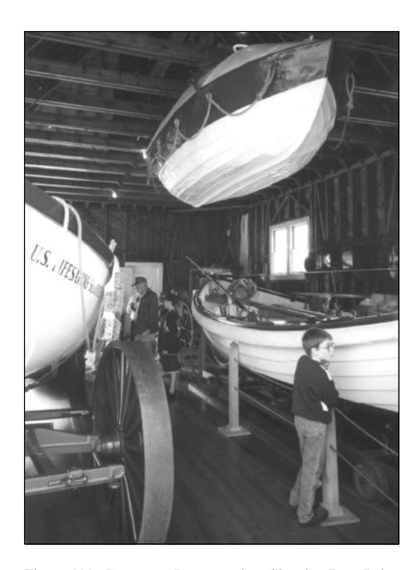
Figure 199. Boatroom Interpretation, Sleeping Bear Point Life-Saving Station, 1997.