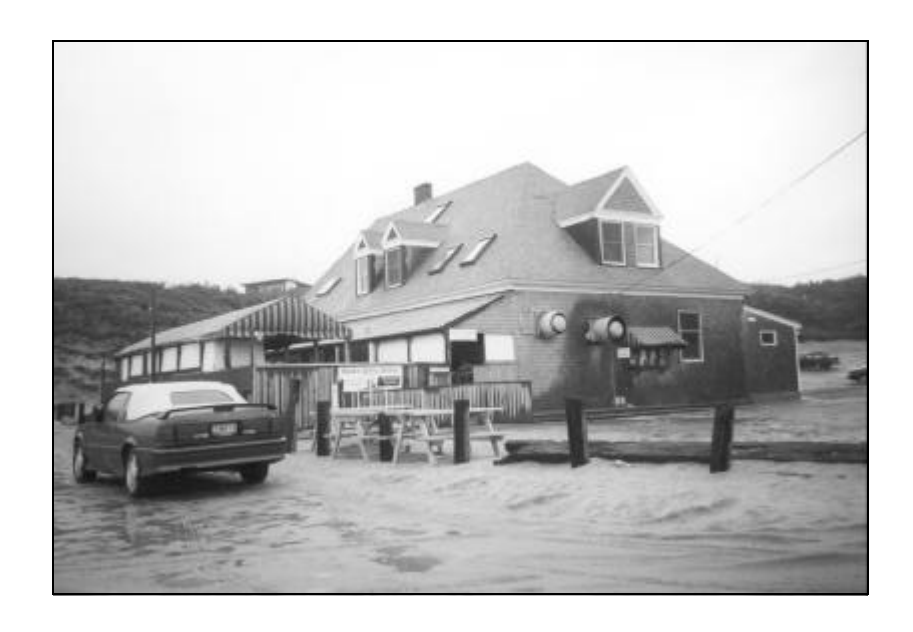
Figure 191. Cahoons Hollow Life-Saving Station (1894) Rehabilitation, Cahoons Hollow, Massachusetts, 1997.