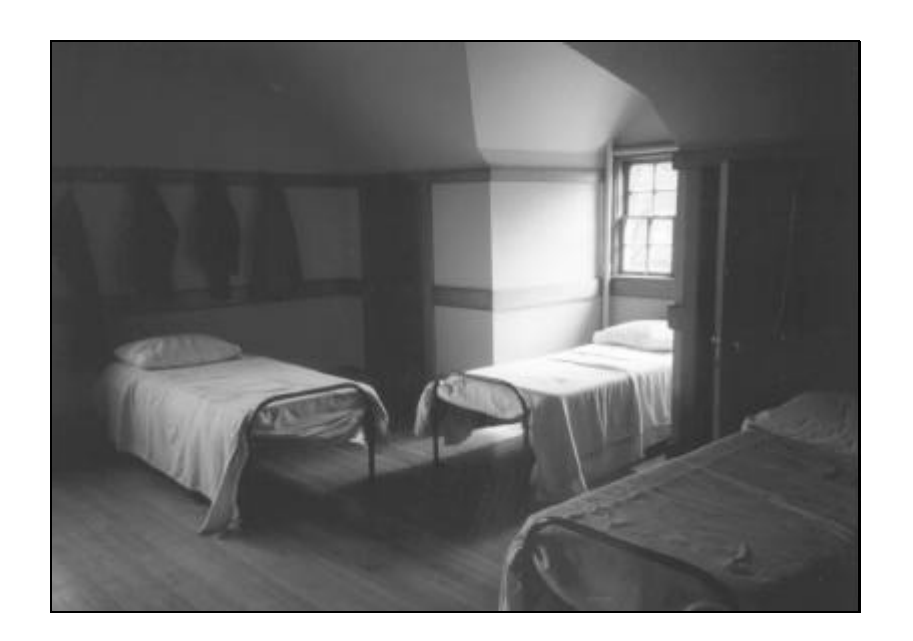
Figure 197. Crew's Quarters Interpretation, Sleeping Bear Point Life-Saving Station, 1997.