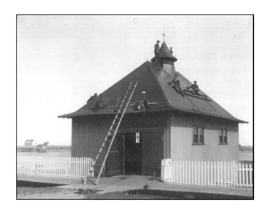
Figure 183. Surfmen Painting the Boathouse Roof, Coquille River Life-Saving Station, Circa 1900.