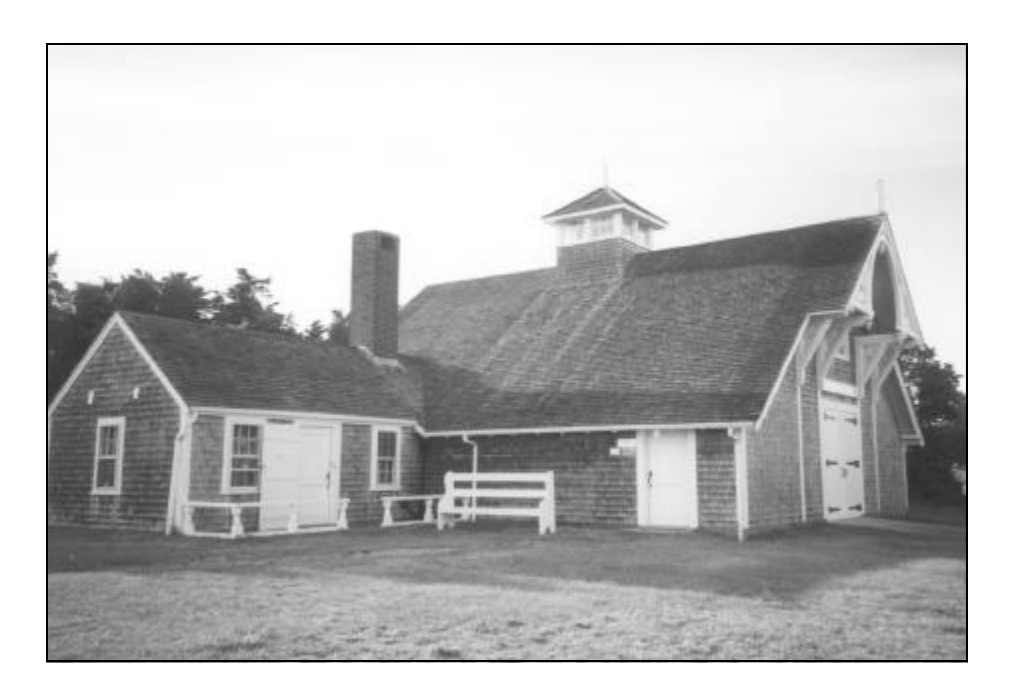
Figure 187. Nantucket Life Saving Museum, Nantucket Island, Massachusetts, 1997.

station in case they could not get a boat out of their primary boathouse. All of the buildings and structures are important in telling the complete story of a station. Viewing all of the structures allows a visitor to completely immerse themselves in the story.