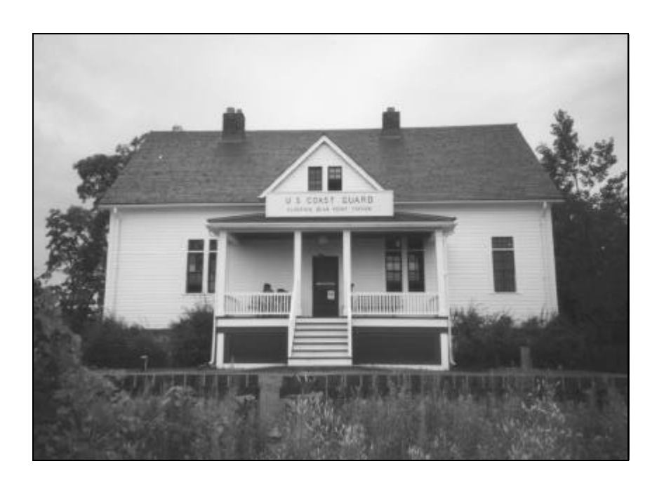
Figure 194. Sleeping Bear Point Life-Saving Station (1901), 1997.

retains its original orientation and relationship with Lake Michigan. Inside the boathouse are a surfboat, lifeboat, lifecar, and beach apparatus cart just as they would have been housed 100 years earlier (Figure 199). Items are displayed in proper fashion, though not in quantities that would have originally occupied the boathouse. The displays are interpreted by trained docents rather than signage.