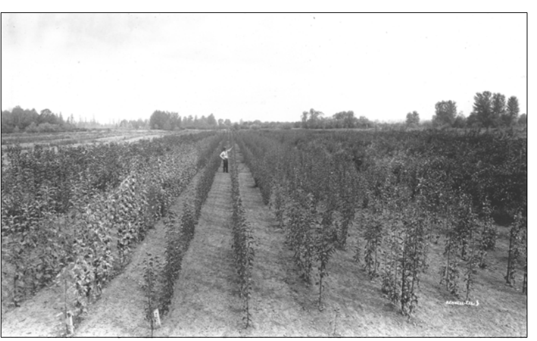
Fruit tree production at Woodruff Nursery on River Road. Photo by Kennell-Ellis courtesy of Lane County Historical Museum (KE887)

The newer settlers from the Midwest and East Coast states brought new crops with them, as well as new techniques such as crop rotation.<sup>16</sup> Though the first grafted fruit trees were imported into Oregon in 1847. horticulture did not become a significant force in agricultural economics until the late nineteeth century. Flax had a similarly delayed acceptance, arriving in the state in 1844-1850 and remaining a minor crop until the war efforts of the 1940s.<sup>17</sup>